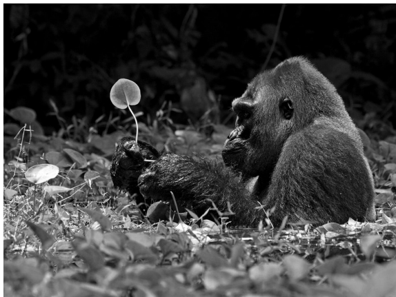
Figure 2. Gorilla in forest swamp, feeding on floating vegetation (AHV). The silverback gorilla “soaks in a swamp for hours, methodically stripping and rinsing dirt from herb roots before munching.”

Laryngeal descent in adult humans has sometimes been interpreted as an adaptation for inhaling large quantities of air—for running (Geoffrey Laitman, personal communication), or to the contrary for diving in human ancestors (Morgan & Verhaegen, 1986)—but both these interpretations are contradicted by comparative data. Once more, we have to analyse human laryngeal descent into smaller elements. Nishimura (2003) described two components of laryngeal descent: hominoids, as opposed to monkeys, have the larynx descended in relation to the hyoid bone, but only in Homo (and possibly partly in chimpanzees, see Nishimura et al., 2006) is the hyoid descended in relation to the mandible, so that the larynx in adult humans (Adam’s apple) is lower in the neck